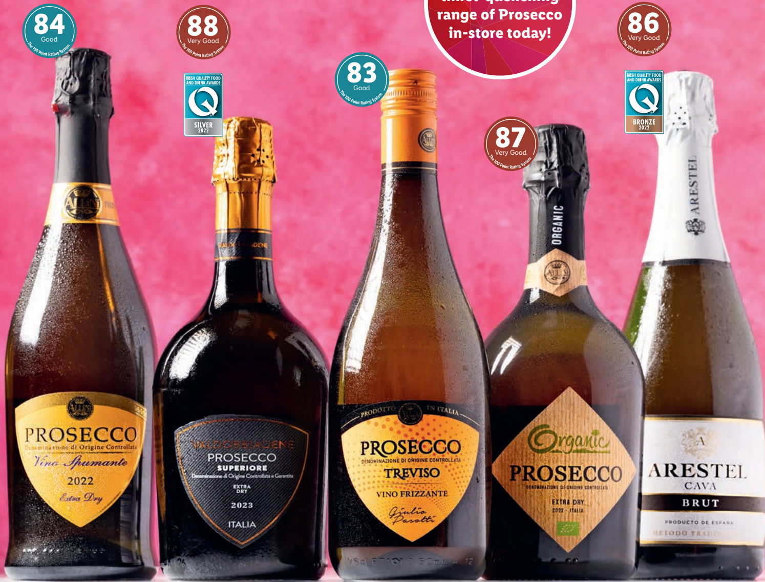
Prosecco Spumante Italian

Check out our thirst-quenching range of Prosecco in-store today!