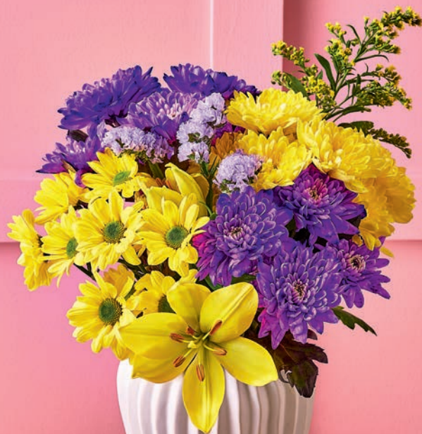
Spring Meadow Bouquet